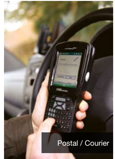
Postal / Courier