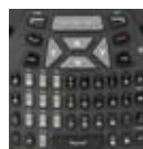
Full alphanumeric Qwerty (S model)