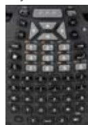
Full alphanumeric ABCDEF (C model)