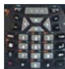
Numeric only (S model)